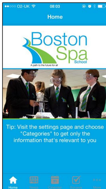
Main School Home Page